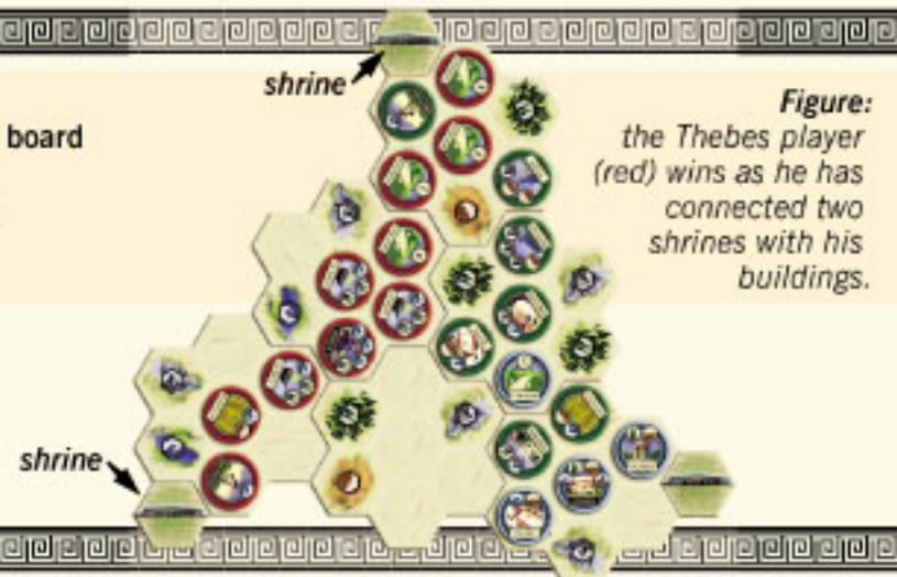
Figure: the Thebes player (red) wins as he has connected two shrines with his buildings.